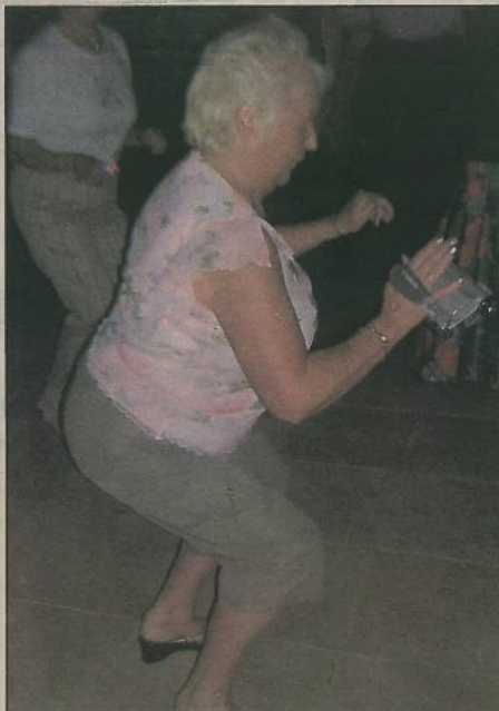
This guest was caught 'winning and touching her toes' at the official opening of Sandals Grande Ocho Rios. She proved that age is just a number.