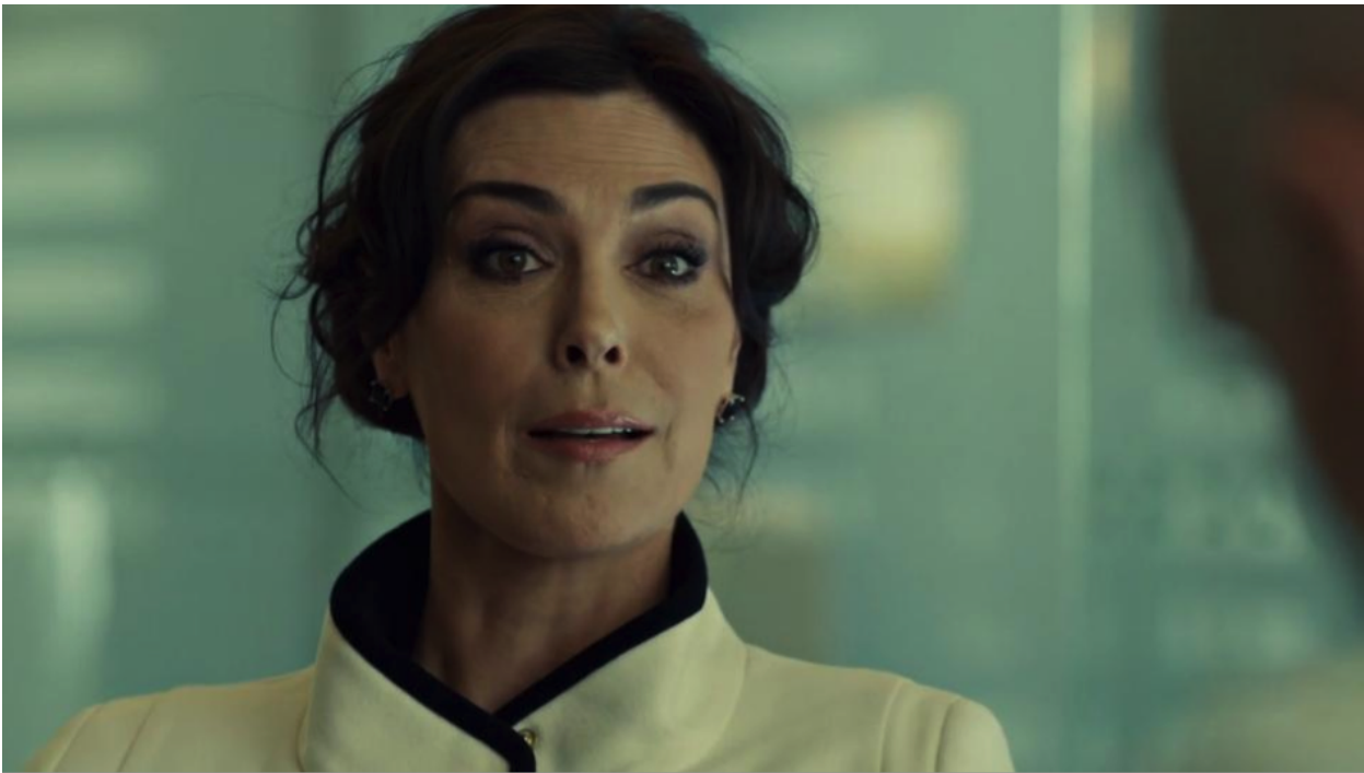
Marion Bowles seems to be a big player in DYAD.

Paul returns to DYAD and it is apparent that he’s now on “Team Mrs. S.” when he tells Leekie that he followed Sarah, but came up with nothing. And there is no scientist. It’s unclear to say right now if Leekie believes him, but he tells Paul to give Rachel his findings. He immediately wants to talk to a “ Marion Bowles ”.