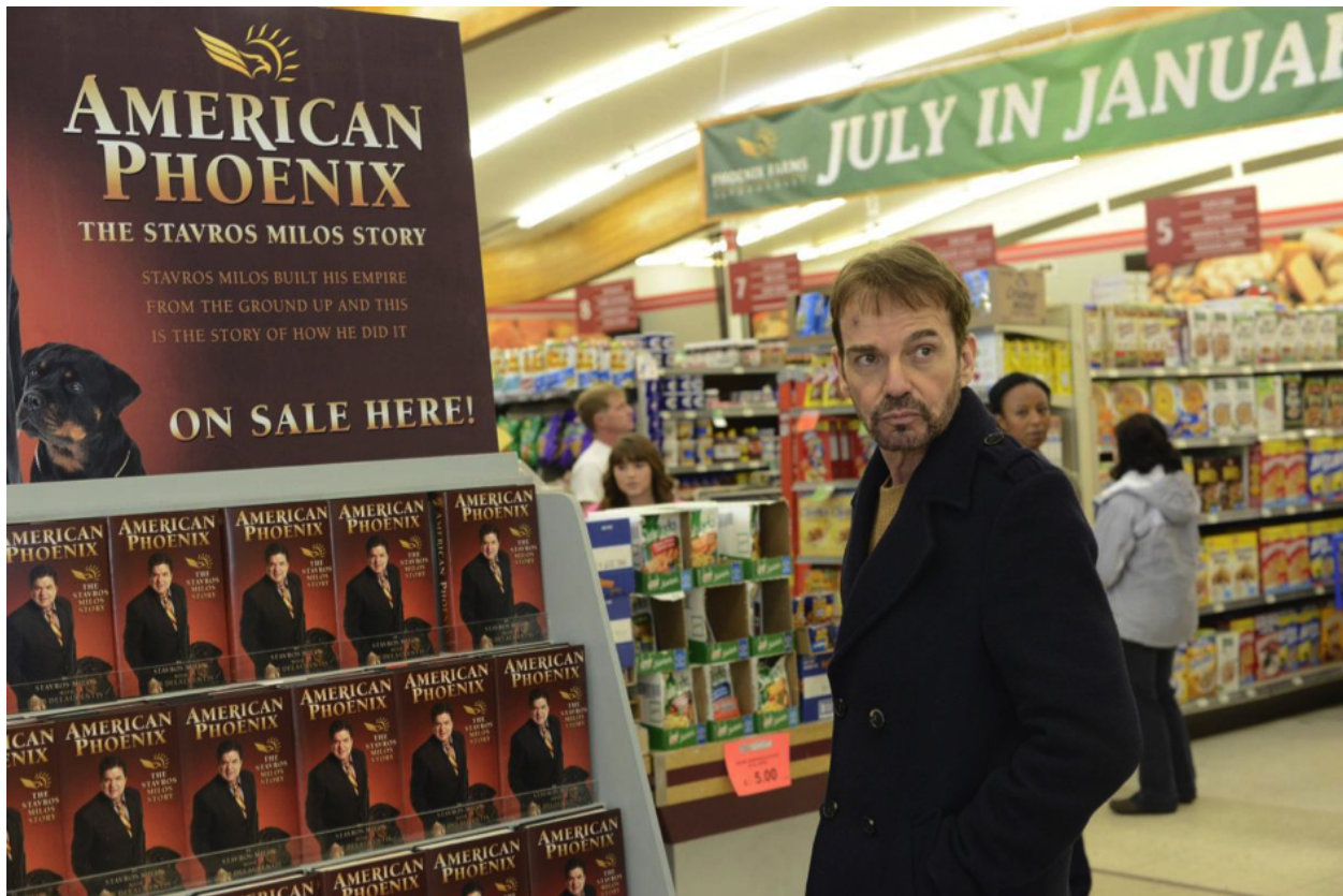
Billy Bob Thornton gave a convincing performance as killer, Lorne Malvo.

another familiar face, British actor Martin Freeman who's had his time on the silver screen, and also in recent years found critically acclaimed success in the BBC America suspense drama, Sherlock .