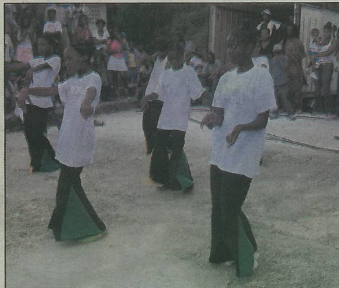
Members of the Sturge Town Youth Group enthralled the audience with a beautifully choreographed dance.