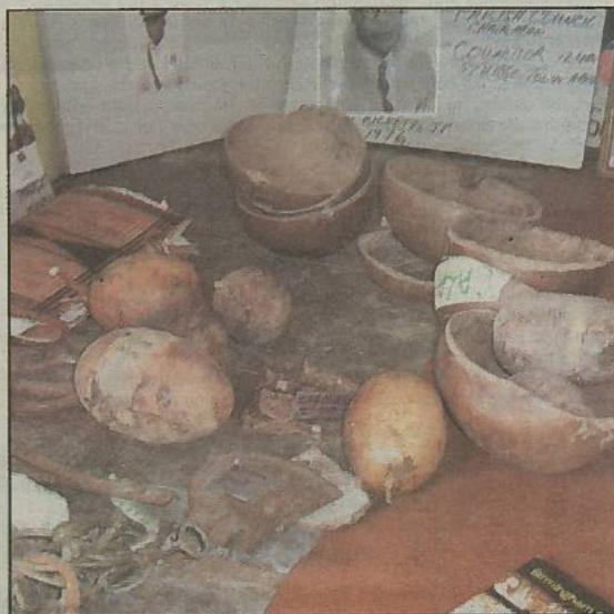
A historical display of items used in slavery days. This include calabashes and a piece of limestone.

the older folks seemed to relate more to the songs. The children were in a world by themselves, as they "abandoned" their adult counterparts and went to play and dance by themselves.