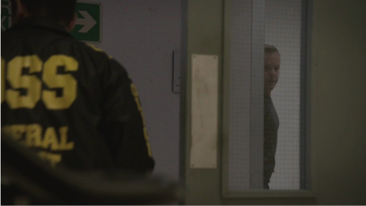
Jack has to find a way out of the embassy.

“Your mother or me.” She says yes but I don’t know if that ‘yes’ REALLY means “we’re leaving together” or “yes for now but I’m killing you later.” Mommy dearest isn’t feeling that idea and gives Naveed a chance to redeem himself. He refuses. She uses Simone as a pawn to change his mind. She gets one of her henchmen to cut off one of Simone’s fingers. He complies.