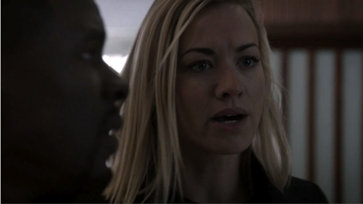
Kate is not giving up on Jack. She believes he's trying to help.

Kate and Eric speak to Tanner and get the information about why Jack is at the embassy and interested in him. He tells them he's there to stop an attack on Heller and also to help clear him. They don't totally disbelieve him but they know they need to talk to Bauer to get all the info.