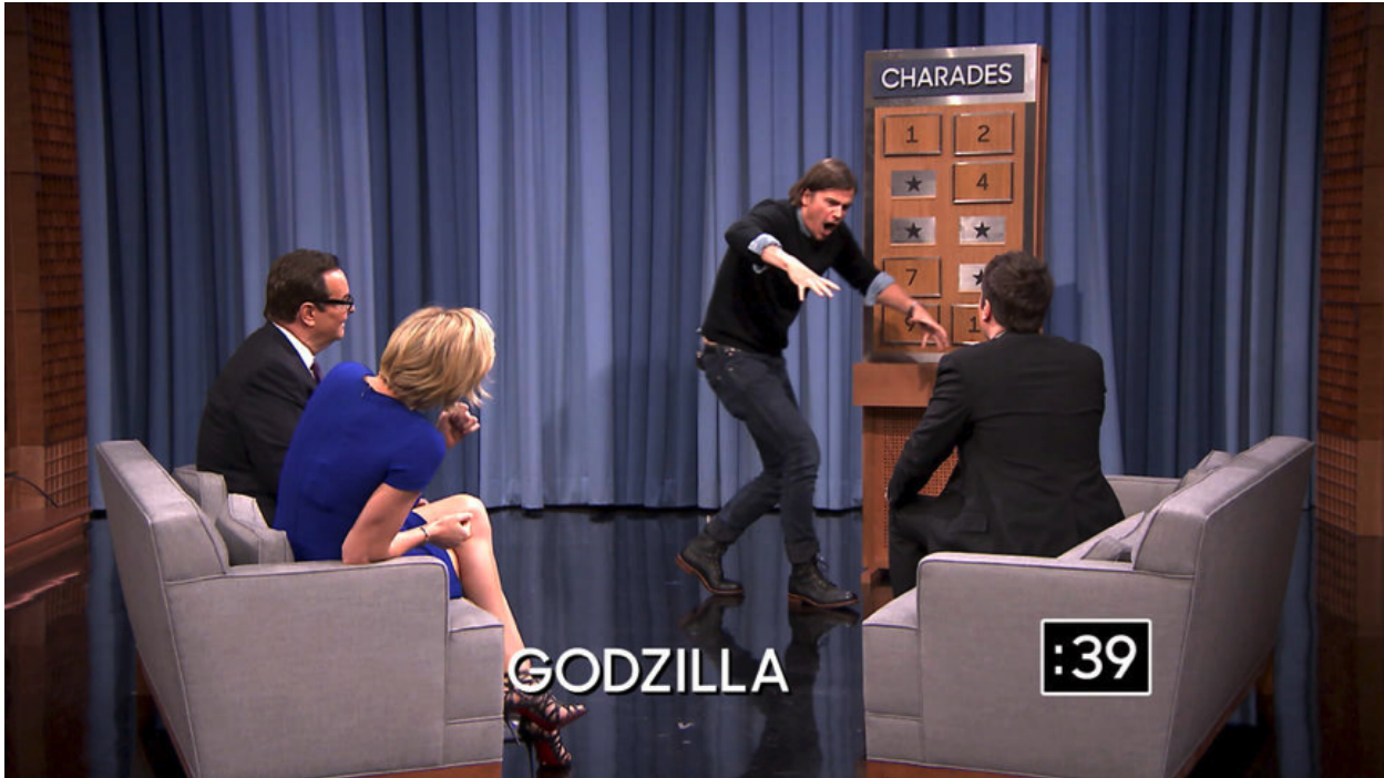
Yeah...that looks about right.

The Roots performs "Never" off their new album And Then You Shoot Your Cousin .