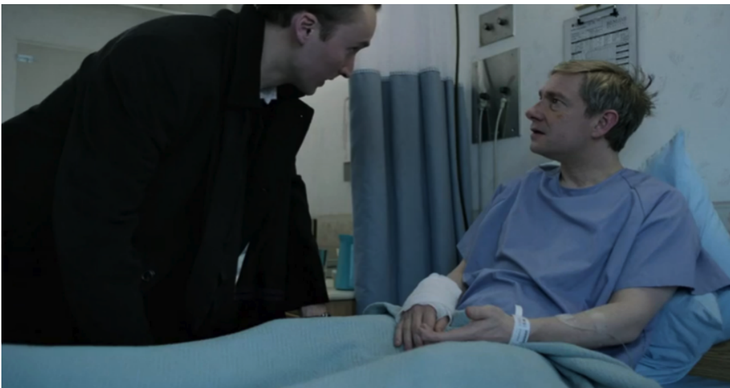
Lester’s brother makes it clear how he feels.

Lester seems to be all alone in his situation. When your own brother tells you “You’re not right in the world” you tend to feel isolated. But he doesn’t plan to stay in the hospital for long and manages to leave without alarming the police officer left there to watch him.