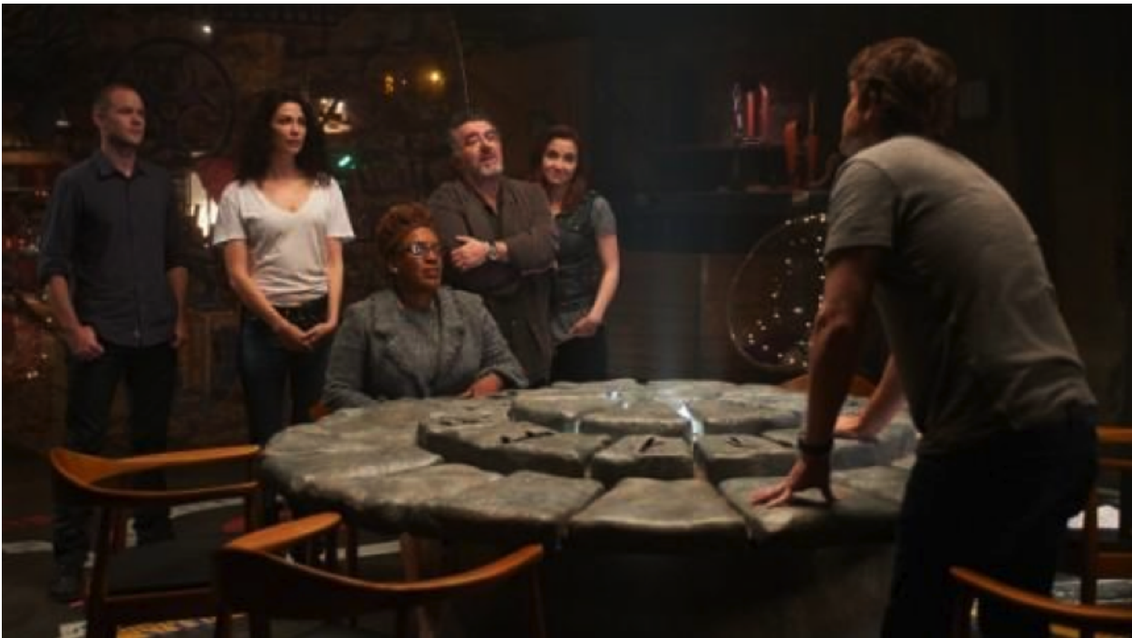
The Warehouse 13 team faces its defining moments.

The series finale seemed to have come up on us so quickly. So it's fitting that they use the episode to reminisce. I'm using reminisce loosely because they're not really going back to scenes from old episodes but making up old memories for the episode. Anyway Mrs. Frederic says Warehouse 13 is coming to an end so they have to contribute to the time capsule showing highlights of their lives in the warehouse that were the defining moments...what made them want to be agents. While everyone else is trying to come to grips with the end, Pete wants to be more proactive about the situation and stop them from losing the warehouse.