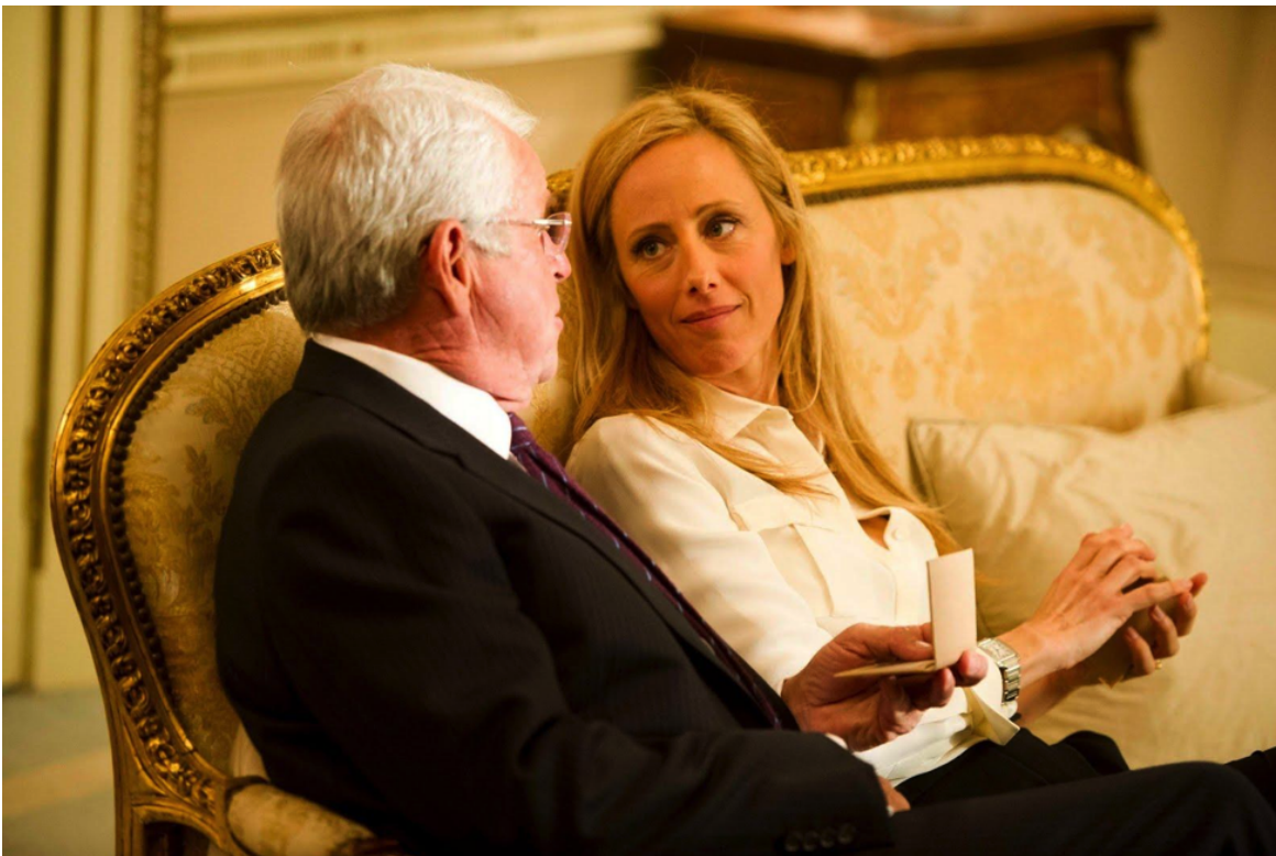
Heller saying his last goodbye to Audrey.

What makes Heller's decision a little bit harder to swallow is the beautiful scene between the phenomenal Devane and Kim Raver (Audrey) who, for several seasons, so effortlessly captured the close knit relationship between father and daughter. The scene is bittersweet. He asks, "Do you have the photo of when you were a little girl on the beach?" making sure to not show any kind of sadness. She shows the photo (her good luck charm) to him and they reminisce for a while, but she cuts the nostalgia short. She has to get back to work. It makes you look into your own life and makes you realize that sometimes you have no idea when you'll lose someone close to you, and Audrey has no idea what's about to happen. Close to tears, Heller leaves her office to face his decision/fate.