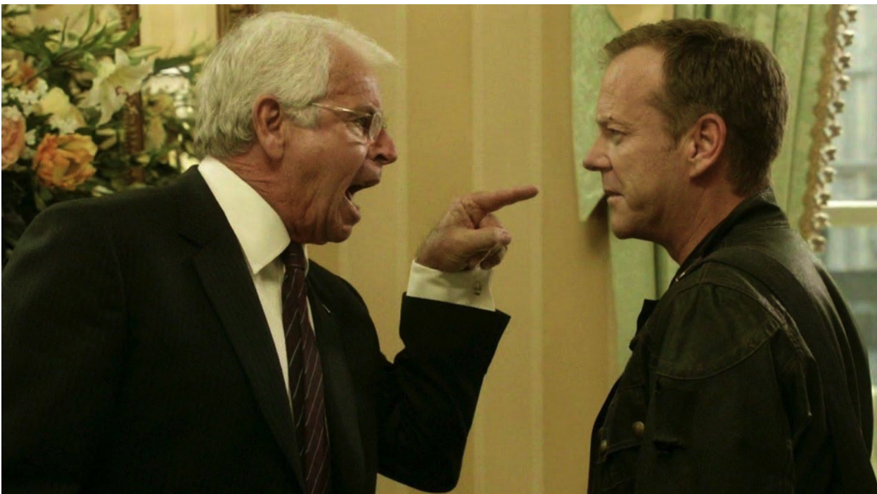
Heller is going out on his own terms, whether Jack likes it or not.

Heller decided to sing his swan song and go out his own way, not wanting to give in to the ravages of Alzheimer’s. In the middle of the confusion, Heller seems to be the one with the clearest head, making the decision to turn himself over to Margot for her to give up controls of the drones. He entrusts Jack with his decision who’s understandably not entirely enthusiastic about it, but after an impassioned speech (and an Alzheimer’s admission) from Heller, Jack decides to help carry out his plan. Frankly, William Devane (Heller) NEEDS to get an Emmy nomination for that performance.