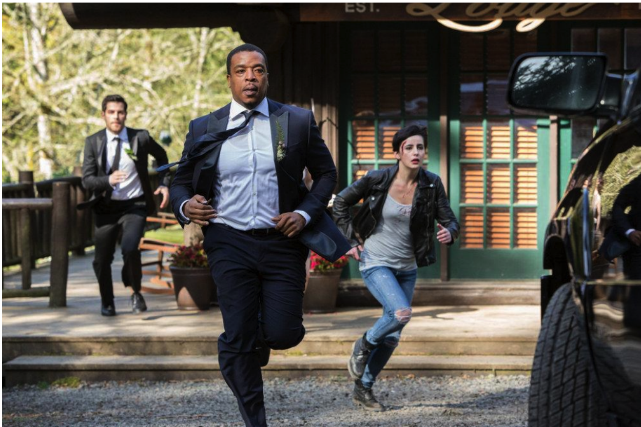
All hell broke loose after the vows. At least Rosalee and Monroe actually got married, right?

She calls 911 for Renard and rushes to the wedding to give Nick the potion. THERE'S another reason that could wreck the wedding. She's a Grimm and doesn't know about the eye thing. Yikes! Renard is close to death. It's not looking good.