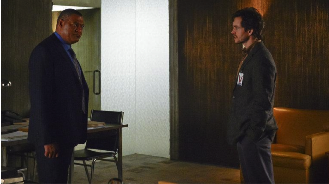
Jack needs some answers...now!

But this time, what Hannibal is offering is totally different from persuasion and influence. He wants Will to join him in taking care of Mason. Will isn't too accommodating of that offer. He points out that everything Hannibal does is for his own benefit and this offer is no exception. He wants Will to be a part of this to stay indebted to him.