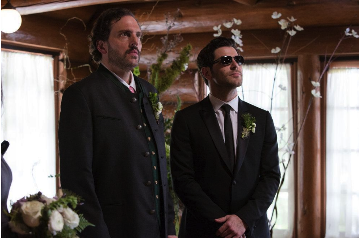
Nick (right) better keep those glasses on.

Adalind is trying to stir things up with her new found identity (as Juliette) by visiting and kissing Renard, bringing back up the circumstances of the curse last year. Neither Juliette nor Renard want a re-do, but Adalind is making sure she keeps them confused. I have no idea how this is going to get her baby back. Maybe this is just a revenge thing.