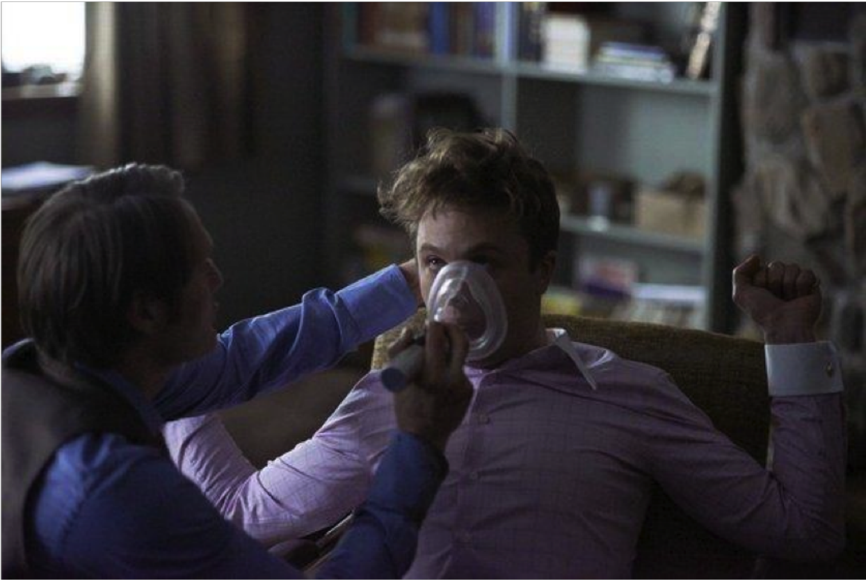
Hannibal has some plans for Mason.

Here is where the persuasion part comes in. He's trying to persuade Will to kill Mason. But Will doesn't budge. Hannibal snaps his neck. Oddly though, he doesn't die. Mason is in bed with contraptions on his face and a face guard resembling the one in Silence of the Lambs. Jack questions him but he gives him no answers he can use.