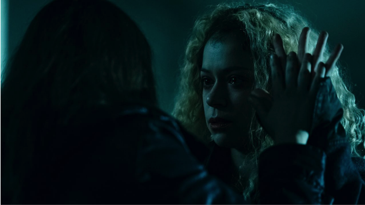
Sarah talked Helena out of killing Rachel.

The Proletheans have Gracie locked up (with a sewn up mouth) after trying to kill Helena, an event that allowed Helena to escape. Henrik and his wife want her to tell the truth but she's mum on the subject. Guy visits her with some food (is it his doing or did Henrik put him up to this?) and persuades her to tell the truth. She complies, but says she wasn't killing a person. It was just like "killing a coyote trying to kill our chickens".