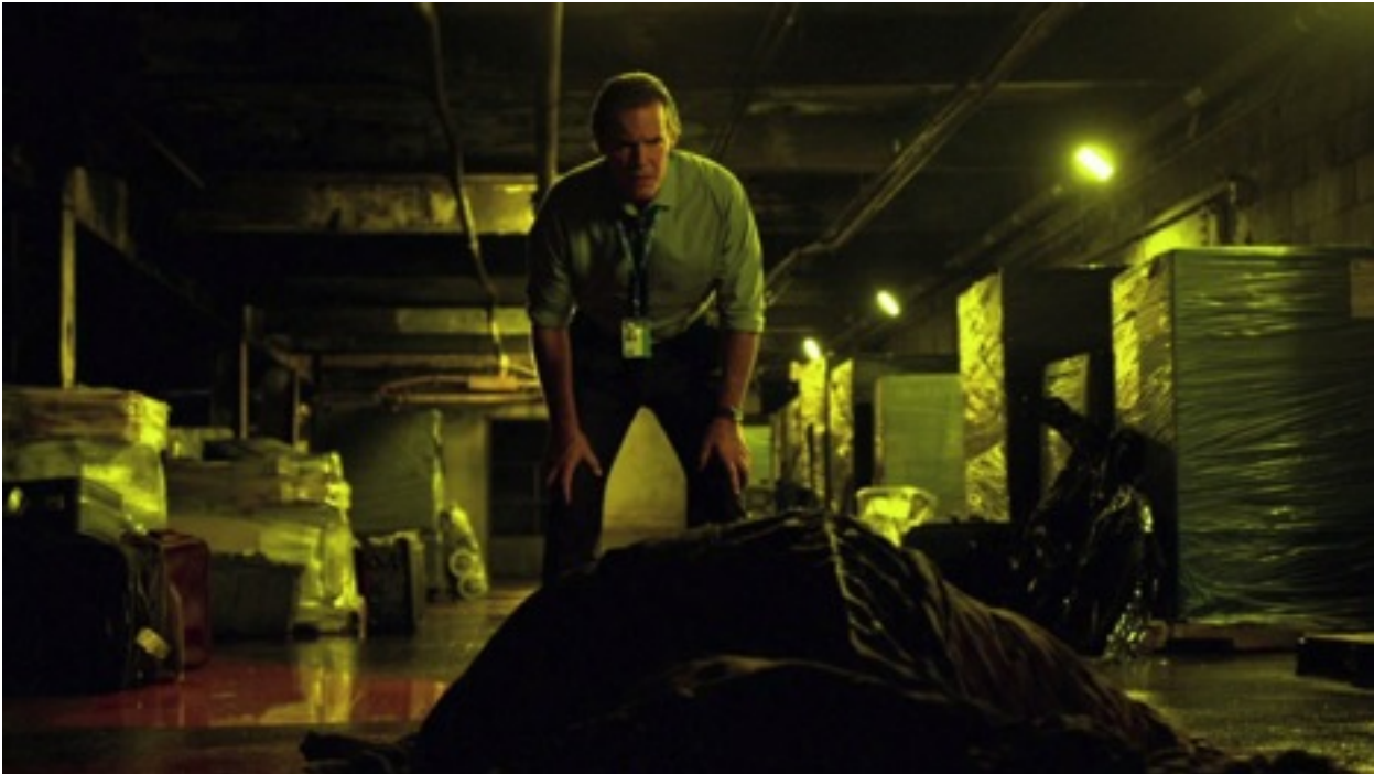
Bishop moments before he meets his, er, Master.

(sorry, I was trying to find a nicer way to say it, but...I couldn't). Can't forget the exposed and tumbling entrails. And Neil Diamond's song, "Sweet Caroline" playing during the group feast kinda made things a bit creepier.