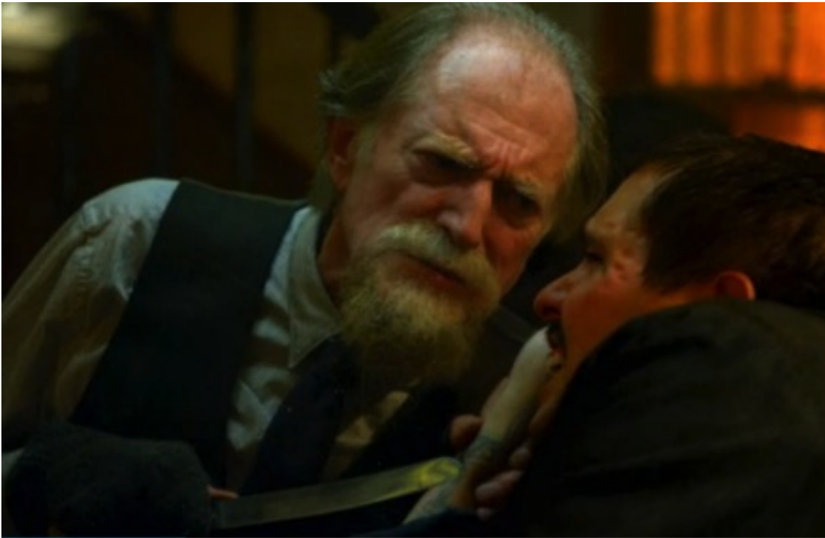
Holocaust survivor, Professor Abraham Setrakian handles himself in a robbery.