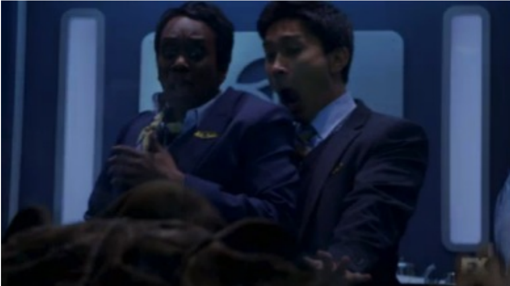
The stewardesses come face to face with The Master.

It's bad enough that in this day and age, when flying, you hope you get to your final destination in one piece (no crashing, no crash landing, no plane disappearing...you know, the usual, simple concerns). But when you as the air stewardess hears a noise that shouldn't be there, a noise coming from the cargo hold, you start to panic. The cargo hold is where the luggage is kept. "There are no animals on the manifest." So what could it be? Well, the The Master burst his way out of the compartment and the rest of the plane's history is, well, history.