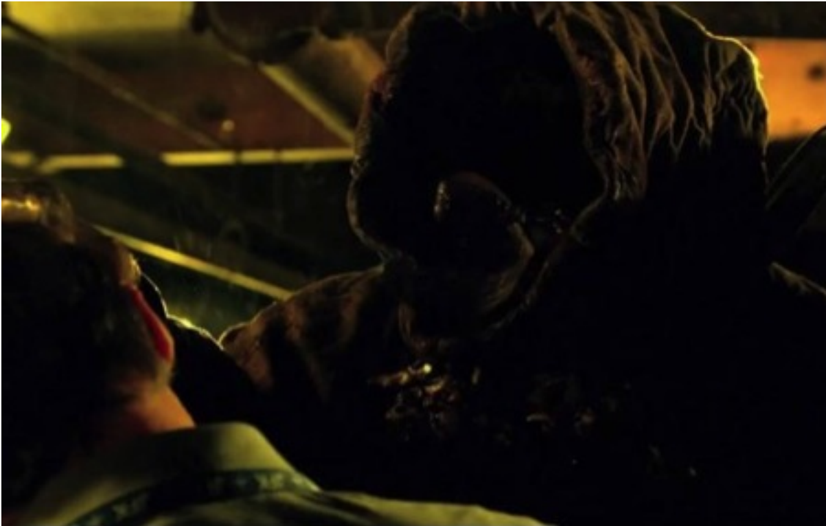
The Master lays waste to Bishop.

passengers on board dead, well, almost everyone, as four passengers later wake up out of their DEEP “sleep”. The rest seemed to have died of some virus, but as the story unfolds, it’s revealed as a strain of vampirism which will later turn the rest of the passengers into blood-sucking beings. But that didn’t just happen out of the blue – a mysterious and ominous 8-foot-tall being was an unwelcomed passenger of the ill-fated aircraft. A cloaked, billowy vampire-like figure called “ The Master ”.