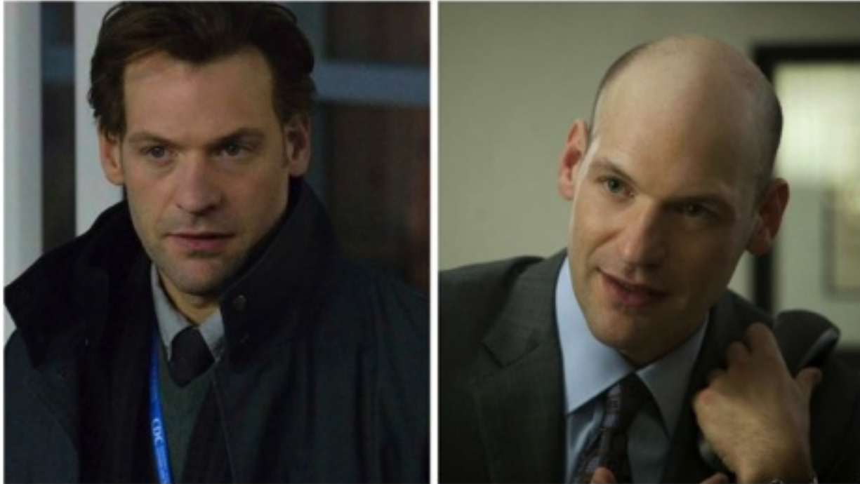
Aaahhmm...can we talk about this?

you'd see that he's bald...or bald-ING. So it came as a...well, not shock, but kind of a distraction when I saw his head accessory in all its glory. Mind you, I had already gotten a glimpse of it in the TV spots. But when you have to look at it for the better part of 90 minutes, you can't help but stare at it. I don't think it's unfair to say that it's a separate character in the show. They just need to give it a name now.