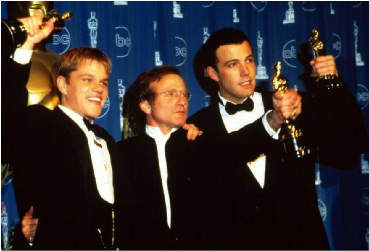
Williams with his Academy Award for his supporting role in "Good Will Hunting". With him are Matt Damon and Ben Affleck with their Original Screenplay Academy Awards for the film.

(including a Cecil B. DeMille Award ), two Screen Actors Guild Awards, three People's Choice Awards, and five Grammys for his comedic recordings.