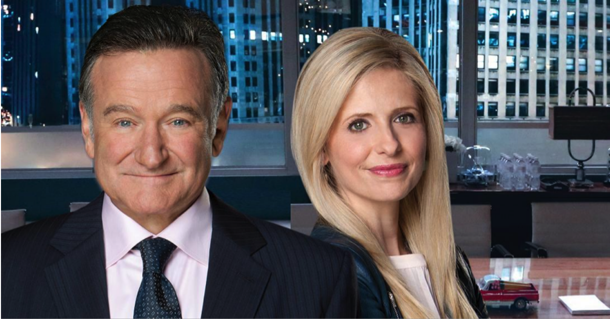
Williams made his return to TV in 2013 in "The Crazy Ones" co-starring Sarah Michelle Gellar. It was cancelled after one season.

But that cancellation was just a blip on a very stellar television career. You say the name "Robin Williams", especially to people alive in the late 1970s and early 1980s, and they'll bring up Mork and Mindy . Williams played Mork, an extraterrestrial alien hailing from the planet Ork, arriving to earth in a small, one man, egg shaped spaceship. He befriends a human female, Mindy McConnell (Pam Dawber) and eventually becomes her roommate (and eventual love interest). The spin-off of the iconic sitcom Happy Days (Mork first appeared on TV in the Happy Days season 5 episode " My Favorite Orkan " in 1978) became a household name, mainly because of Williams' colorful portrayal of the alien. Mork's "Nanu Nanu" greeting helped to propel the show into great success, and it eventually became one of TV's best comedies. In 1997, the show's episode, "Mork's Mixed Emotions" was ranked number 94 on TV Guide's 100 Greatest Episodes of All Time list. It lasted four seasons.