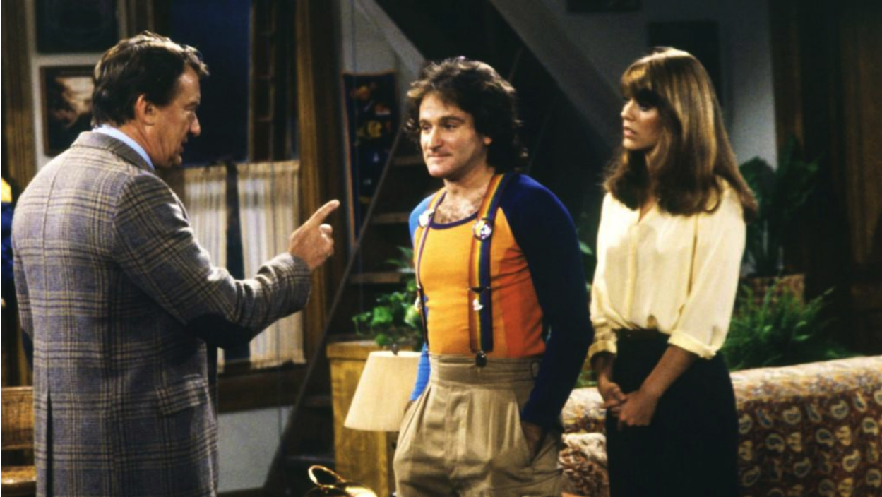
"Mork and Mindy" helped put Williams on the map.