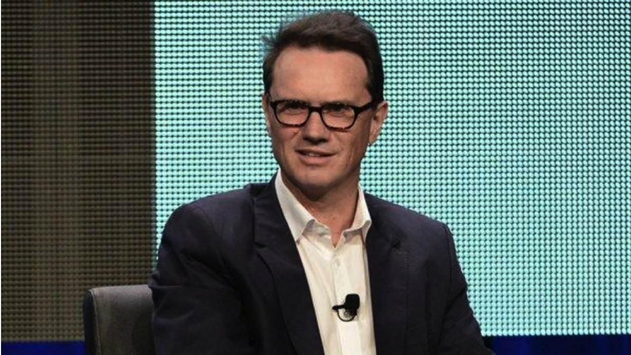
Fox CEO and chairman, Peter Rice sees the potential for future 24 seasons.

But now that the fans' appetites have been whetted, they of course crave more, and obviously want to know if there will be more Jack Bauer in the future. During the Television Critics Association press tour in Beverly Hills on Sunday, Fox chairman and CEO, Peter Rice was asked by critics if there was ever a chance 24 would be coming back for future seasons. "I loved this year's season of 24. I've always been a fan. We haven't had a specific conversation...I'm sure we will in the future," Rice said.