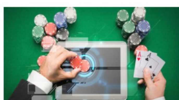
Online Casino Website Employ Sophisticated Software To Quell Cybercrimes