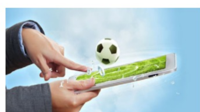
Successful Fantasy Sports Portal Software Solutions