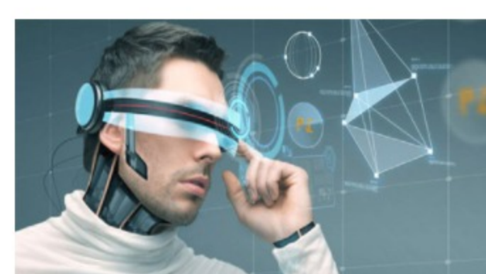
Virtual Reality And Augmented Reality: The Possibilities Are Virtually Limitless