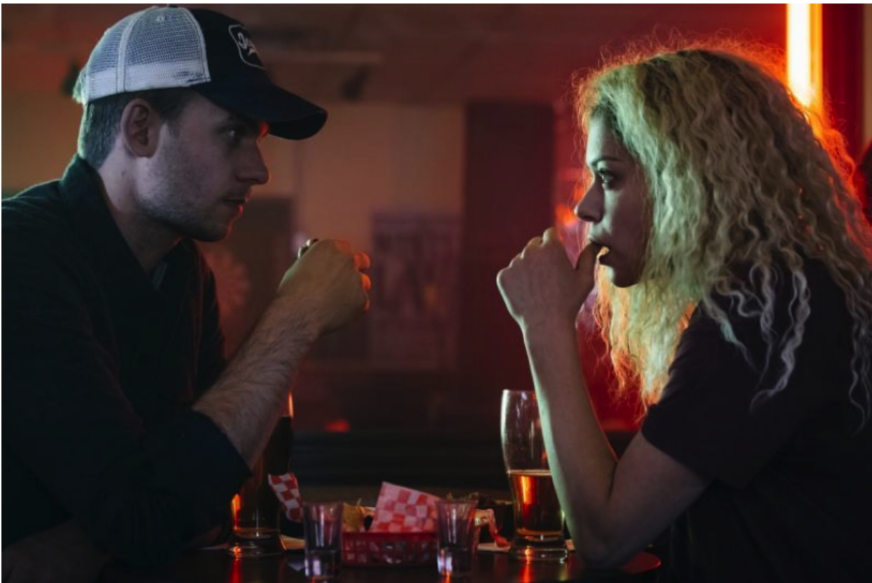
Helena and her knight in shining armor.

A good Samaritan saves her from an obnoxious bar patron (which he really didn't have to do cause she sprained one of the guy's fingers and threatened to break another one). Lo and behold one of the Proletheans steps in. He found her. Paul's been following the sisters and lets the Prolethean know that he needs to back off...of Sarah anyway. He can have Helena. But that's going to be a bit complicated. Helena is involved in a bar fight and is carted off into a police car leaving her wanna-be boyfriend behind (her and the good samaritan fell short of having sex on the pool table).