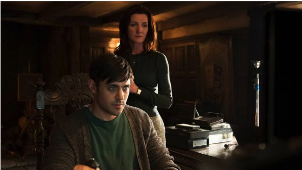
Margot and Ian try to zero in on Simone.

Jack is face to face with Simone asking her about Margot’s whereabouts. Simone won’t give up the information, but Jack being, well...Jack, squeezes the stub where her little finger use to be and she passes out. That’s always been my pet peeve with Jack. How are you going to get the info you need if you kill your perps? Huh Jack? Huh? Anyway, he sees the suspicious Kareem in the hallway and realizes right away that he’s not right. A shoot out in the hospital ends up with Kareem being shot dead by the police before Jack could get anything from him. Margot and Ian are on point with the drone that’s zoned in on the hospital, and send a missile straight into the building. Her plan is thwarted, however, when the hospital is evacuated in time (although there are people who lost limbs), but they have their sights set on Simone, Jack and Kate, and attempt to blow up the car they’re going into. They miss, but get ready to try again.