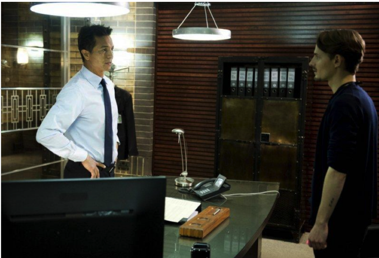
Navarro send Jordan to pick up a "package".

Navarro gets a call from the mysterious boss who warns him that Jordan is still looking into the missing information from Kate's husband's case. The boss is none other than Adrian Cross , Chloe's hacker partner. Surprise, surprise. The plot thickens. He tells Navarro to deal with the situation. "You're being well paid." He sends Jordan into the field to "pick up a package".