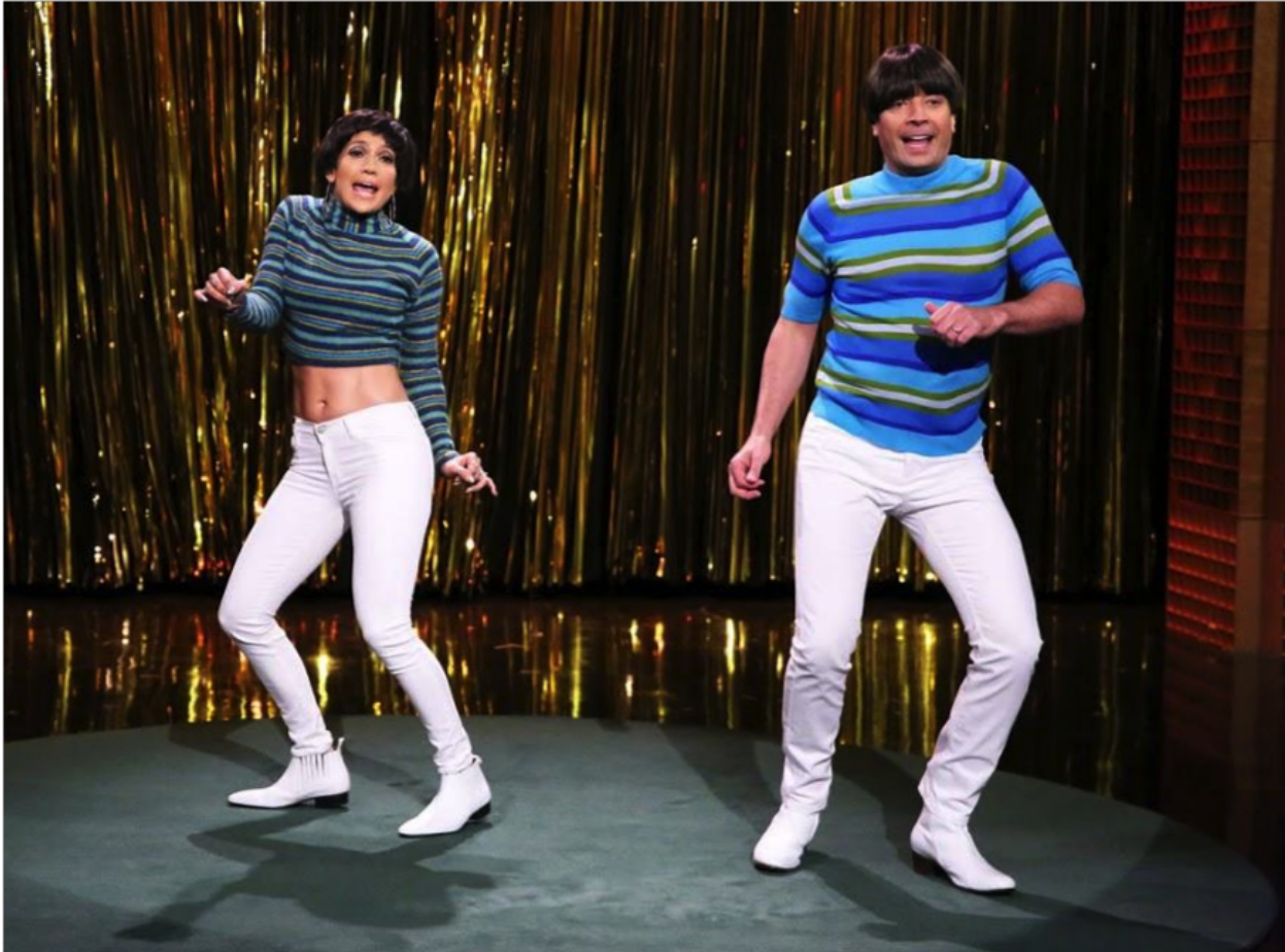
Jennifer Lopez says she has the tightest pants in the town.