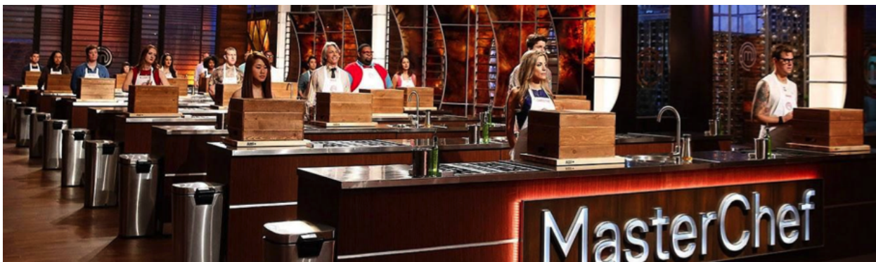
The Top 22 battle it out with the first mystery box challenge.