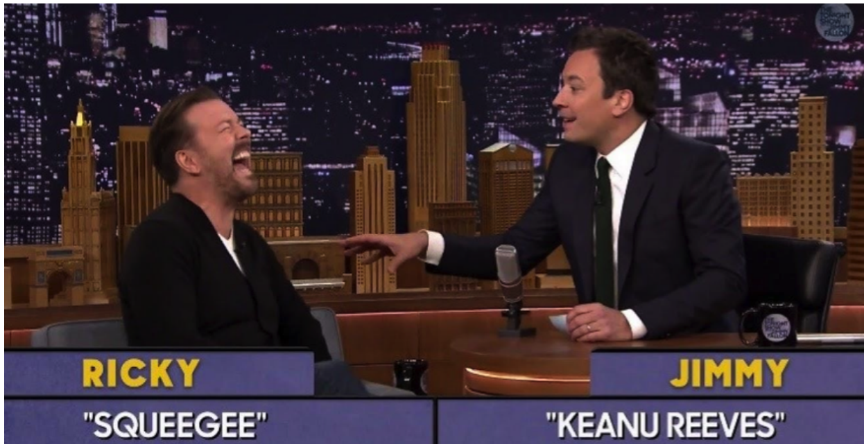
Fallon and Ricky Gervais play a hilarious game of "Word Sneak".

Ricky Gervais visits to talk about his Netflix show, Derek. Turns out whenever he cries on screen he only does one take. "After I cry, I feel better. So I can only do one take." They play a hilarious game of Word Sneak where you try to fit designated words into normal conversation.