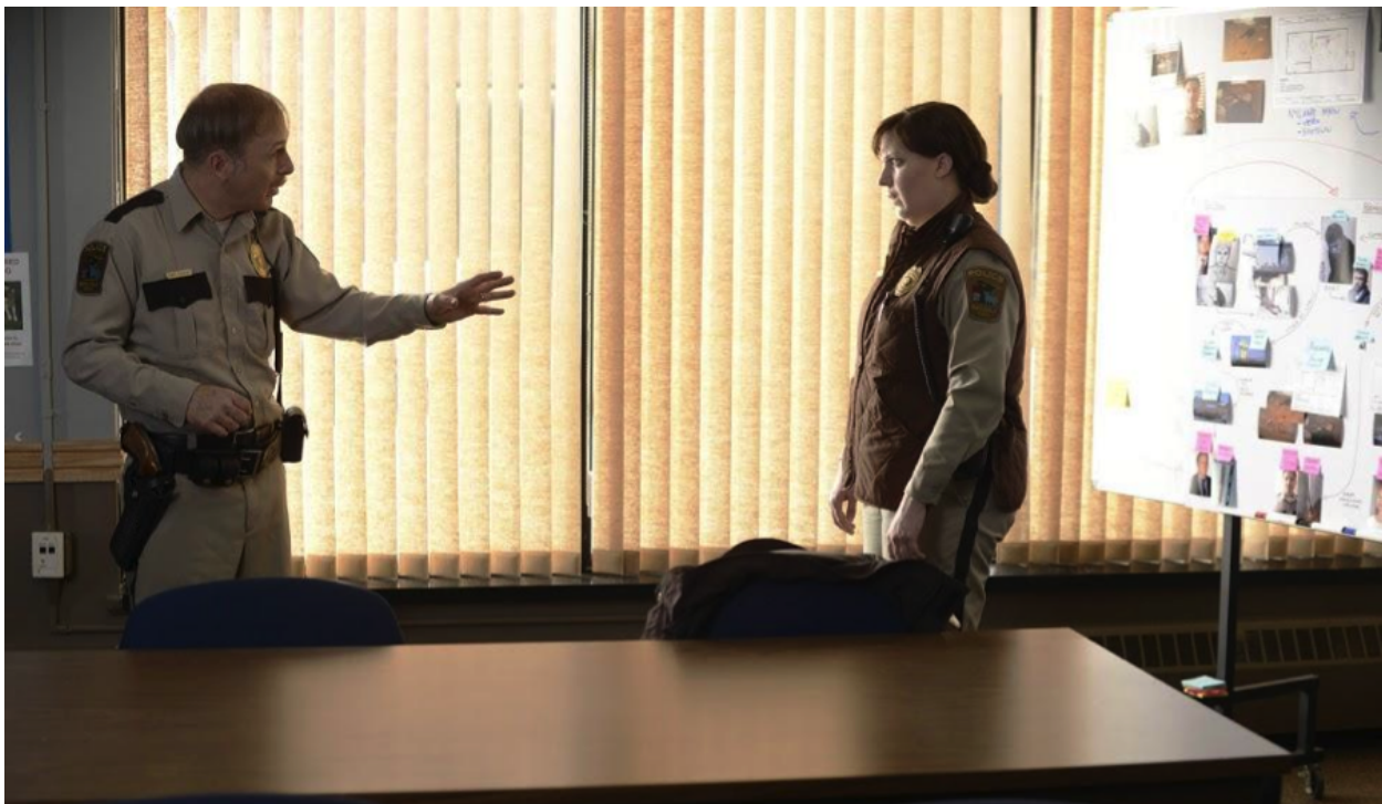
Bill wants Molly to drop Lester's case.

Mr. Wrench's police guard used the bathroom for the last time after Malvo shortened his urinal visit (he was hiding in the stall). How did he know he was going to use the bathroom then? Was he just sitting there all this time and