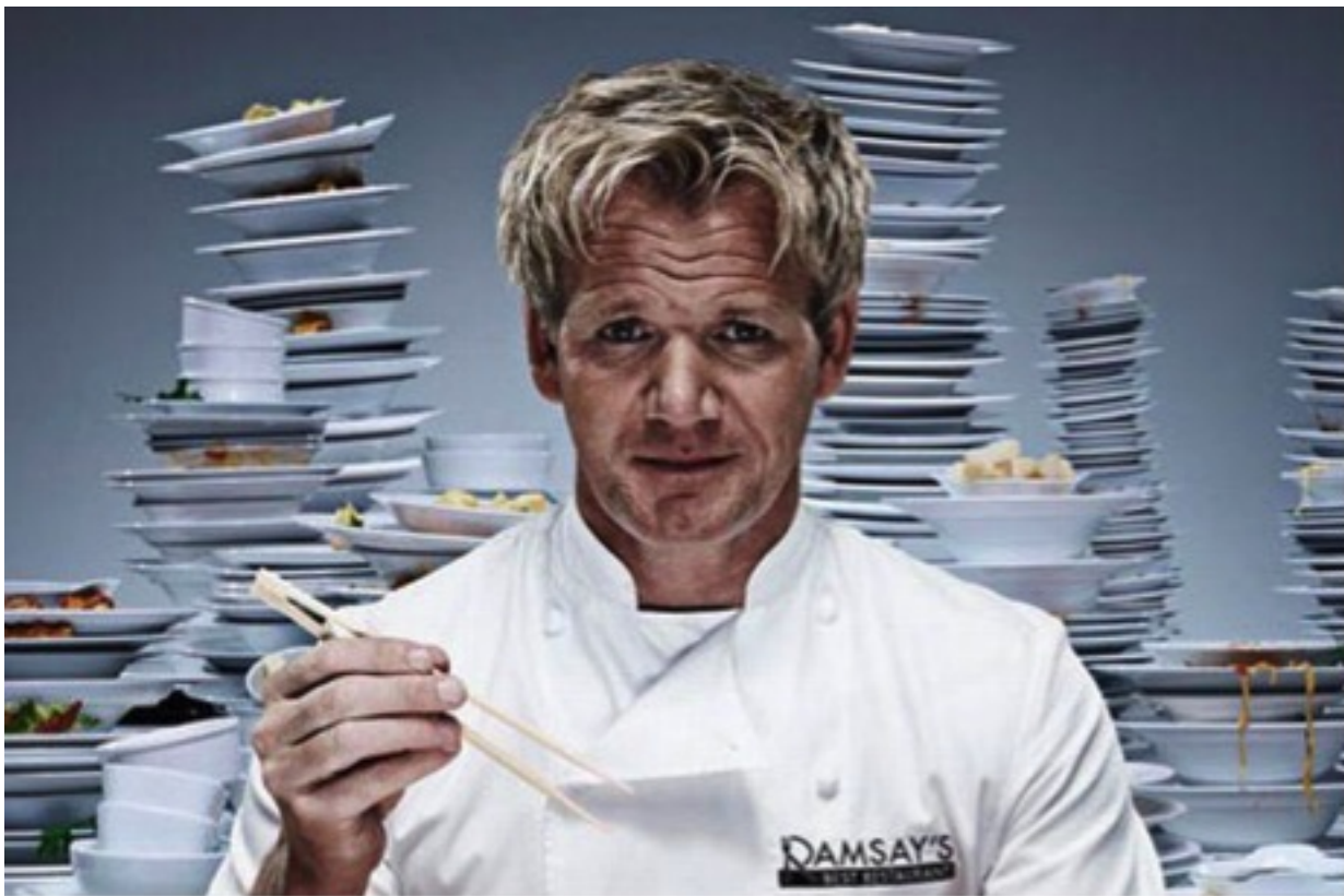
Ramsay has his hands full with his other shows.

This is definitely not the end for television's most fiery chef. He still has his other shows on air. Masterchef is currently in its fifth season, Hell's Kitchen is nearing the end of its 12th season, Masterchef Junior is set to set off its second season, and Hotel Hell returns this month. "I'd like to thank you all for being so supportive. I'm glad I've been able to entertain and hopefully help a few people along the way. It's sad to say goodbye to Kitchen Nightmares but I'll be continuing with my other shows. It's been memorable! Thank you for watching."