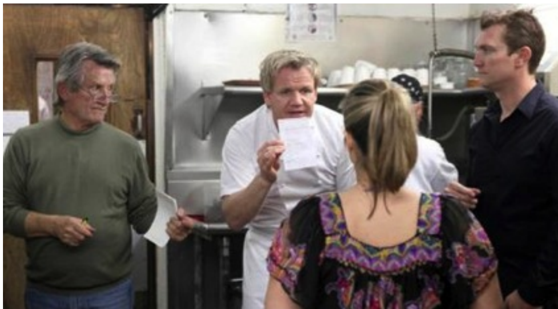
Ramsay "schooling" the owners of La Frite.

La Frite (Sherman Oaks, California) – This episode was wrought with sibling rivalry and resentment. The brother and sister owners were at odds, which left the sister wondering how to deal with her seemingly oblivious and nonchalant brother. Ramsay gets to the meat of the matter and finds out that big brother felt a bit of jealousy, thinking their father was just going to hand over the restaurant to her. He took it out on her and almost destroyed what was once a close relationship. But they eventually got it together and the restaurant flourished .