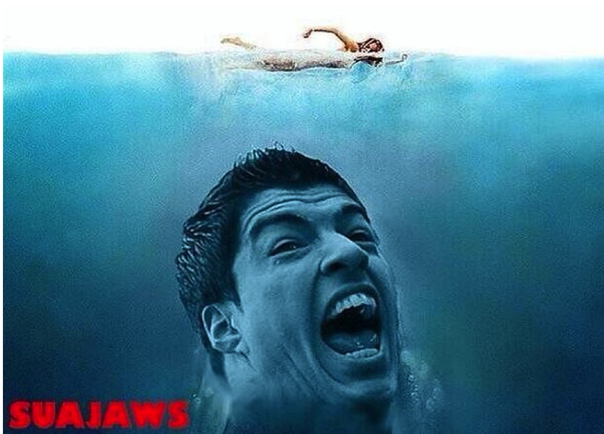
"We're gonna need a bigger boat."

of appearance – the most popular look being him as a vampire. Goes to show that in this day and age, there is no room for a major slip up. You WILL get ‘memed’.