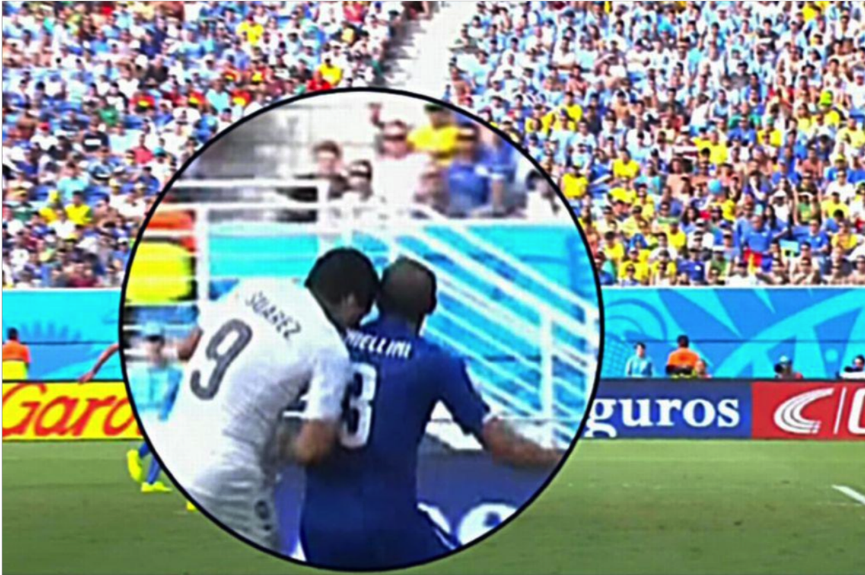
Suarez is captured biting Italian player, Giorgio Chiellini on the shoulder.

But I don't think any contact really compares to teeth on skin. Yes, I said teeth on skin (or teeth through shirt). Under normal circumstances teeth shouldn't be in play during a soccer match. Never. But don't tell that to Uruguay's Luis Suarez who for some reason thinks it's regular behavior to bite an opposing player, especially during the game. During the deciding match between Uruguay and Italy, Suarez decided to bite opposing team member, Giorgio Chiellini. Chiellini, baring the bite mark on his shoulder, desperately tried to get some kind of retribution for Suarez's infraction; however, his appeal to the referee fell on deaf ears. Did the referee see it? I don't know. At least, I don't think so. Judging from the video of the incident it DID happen, and if the referee saw it, it would have warranted a red card which would have thrown Suarez out of the game. But he wasn't reprimanded and kept on playing. A minute later, Uruguay scored a goal, sealing Italy's defeated state. They were sent home.