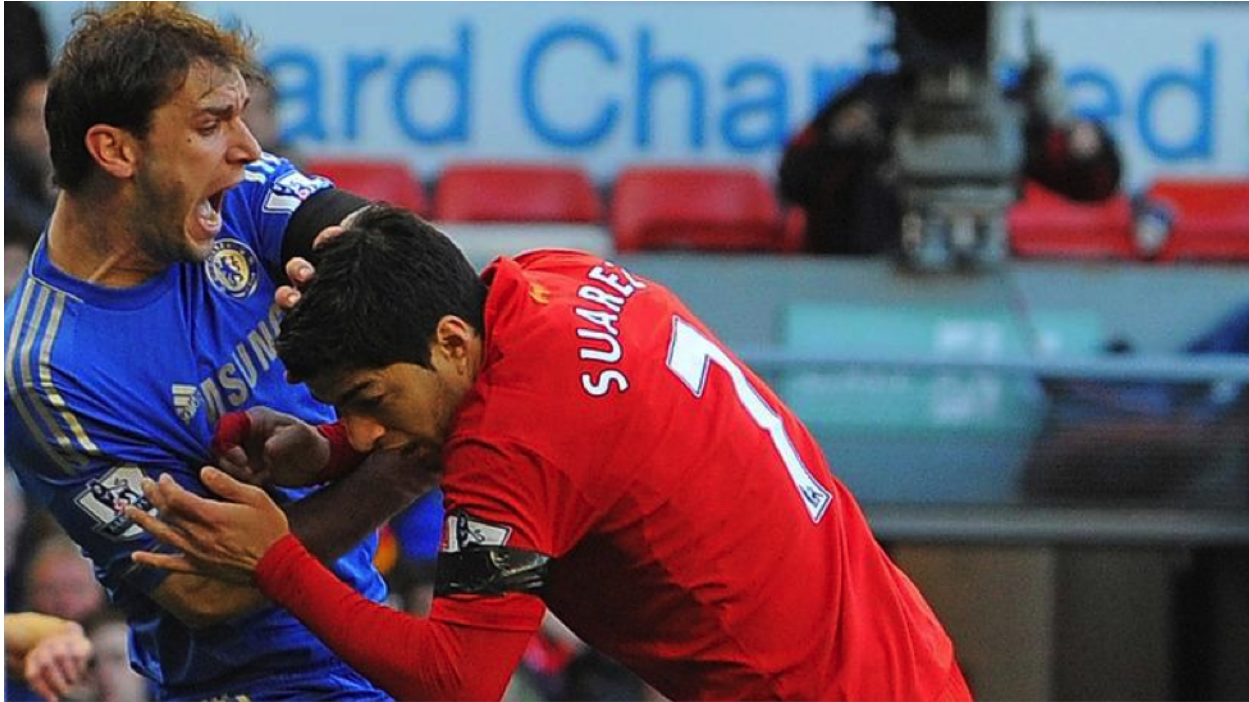
Branislav Ivanovic reacts to the bite from Suarez.