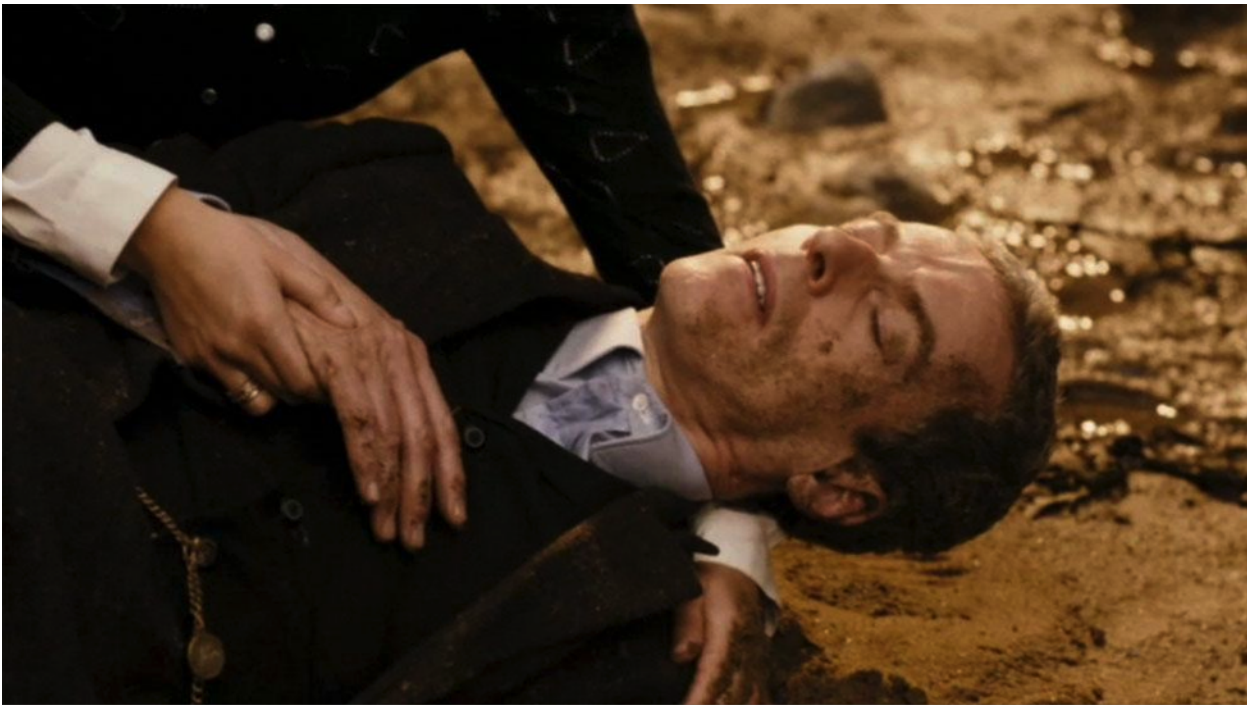
The new Doctor (Peter Capaldi) collapses while still recovering from his regeneration.

It's the Victorian era and there's a dinosaur on the loose in the heart of London which is, I'm guessing, not a normal occurrence. It seemed to have time traveled, and the only way it could have done that was with the Doctor's help (she, yes she, spat out the TARDIS). I don't think he knows that though, because he's extremely mentally worse for wear with the regeneration, babbling and even mistaking Strax for Clara. Clara is still shaken up with the change (too shaken up), but Madame Vastra and Jenny bring her back to reality, allowing her to come to grips with his new face and personality.