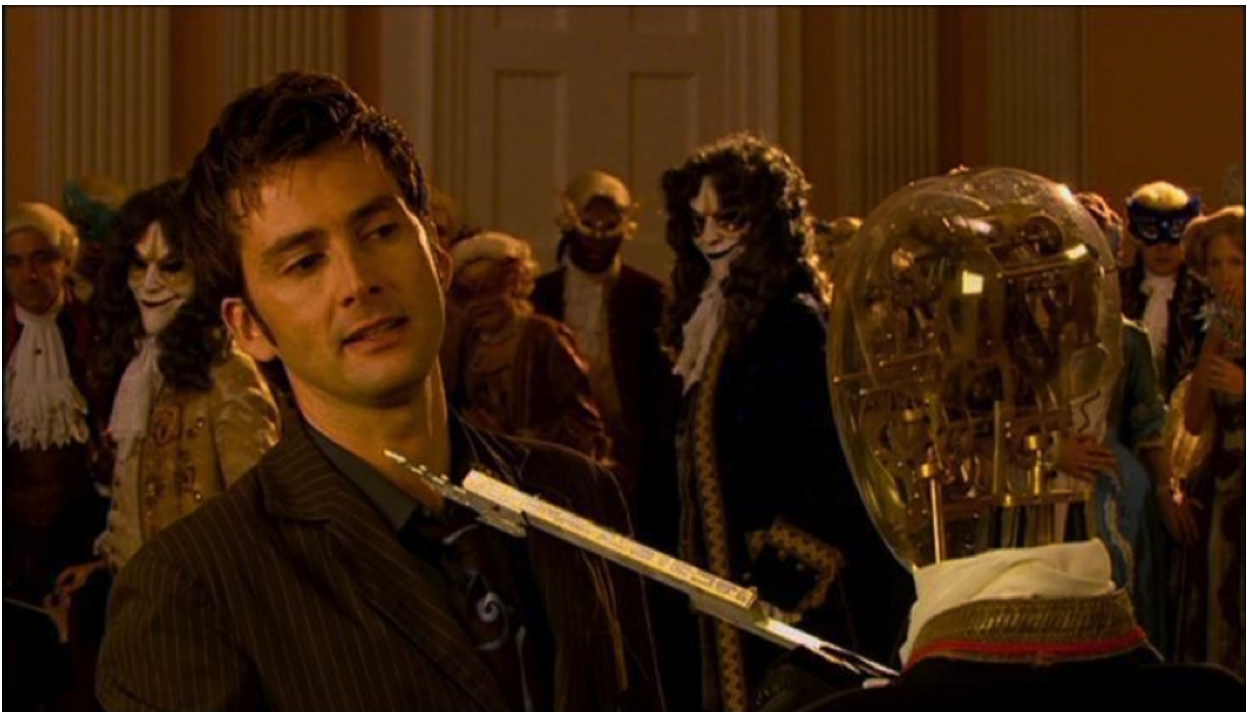
The episode paid homage to Season 2's "The Girl in the Fireplace".

Also kudos for connecting this episode to " The Girl in the Fireplace " an episode in Season 2 which featured androids using human anatomy to build and fuel their ship, Madam de Pompadour. Apparently that's the sister ship to this one. Of course, still recovering from his regeneration, the Doctor doesn't remember a thing about it. He knows he should, though.