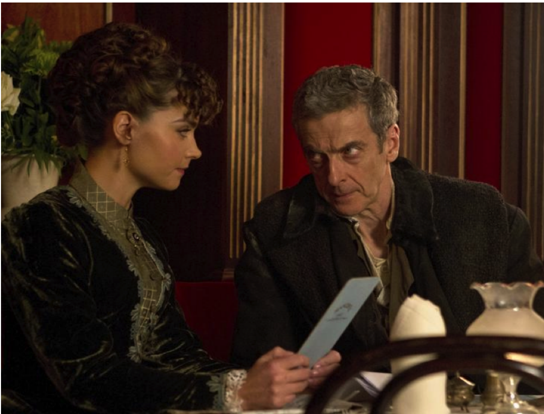
Clara (Jenna Coleman) and the Doctor are lured to a “restaurant” for lunch. It wasn’t pleasant.

This left me wondering if this was a part of the new Doctor...leaving his people behind. But thinking back to other Doctors, they always make decisions that leave you scratching your head. Clara is left holding her breath (hence “Deep Breath”) for her survival (the droids know you’re around when you breathe), and the head droid, the Half-Face Man , threatens to make her meet her demise which works well, because she’s terrified, but like a real ride or die sidekick, refused to give up information on the Doctor. But never fear, the Doctor was there all along and saved Clara.