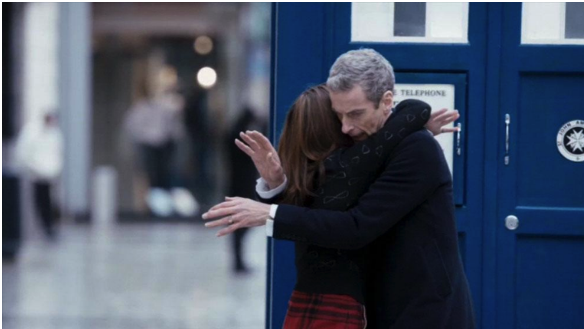
“I don’t think I’m the hugging kind.”

We’re never really sure if the Doctor was in control of all his faculties by the end of the episode, but he sort of comes into his own and seems more confident. Clara eventually comes to terms with the new incarnation, but not before Doctor #11 (Smith) gives her a time-travel type call , asking her to accept the new face, the new hair, the new personality. But I don’t know how I feel about this. I know it’s Clara’s first regeneration, but did her resistance have to be so...much? This made me have to agree with Lady Vastra when she basically accused Clara of ageism...liking the previous Doctor for his youth and good looks.